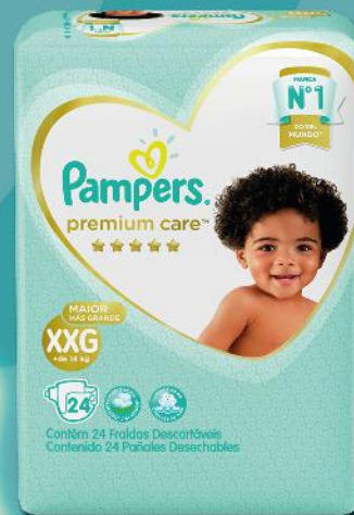
Pampers PremiumCare XXG (24pañales) ME03BP025 7500435132398