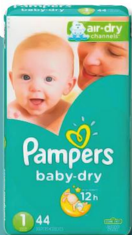
Pampers Baby Dry Jumbo Pack S1 X44u ME03BJ006 37000862086