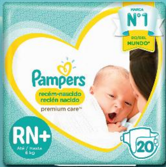
Pampers PremiumCare RN (20pañales) ME03BP020 7500435132503