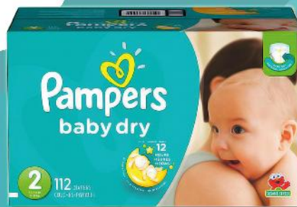
Pampers Baby Dry Super Pack S2 X112u ME03B9001 37000862222