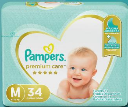
Pampers Premium Care M (34pañales) ME03BP022 7500435132367