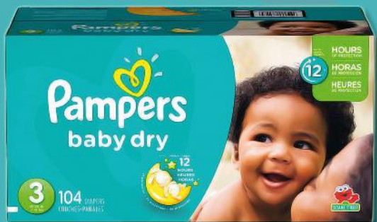
Pampers Baby Dry Super Pack S3 (M) X104u ME03B9005 37000862239