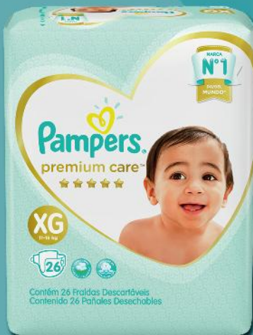
Pampers PremiumCare XG (26pañales) ME03BP024 7500435132381