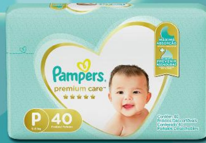
Pampers Premium Care P (40pañales) ME03BP021 7500435132350