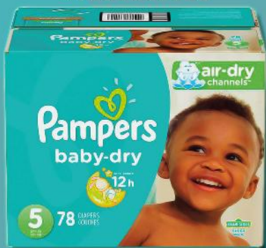
Pampers Baby Dry Super Pack S5 (XG) X78u ME03B9020 37000862253