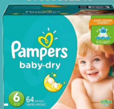
Pampers Baby Dry Super Pack S6 (XXG) X64u ME03B9025 37000862260